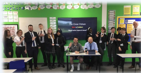
Semi finals of Great Debate. Cuthbert vs Bede.